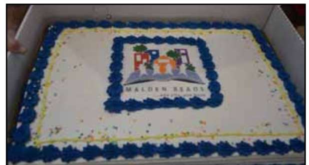
Yum! A Malden Reads cake to celebrate our third anniversary.