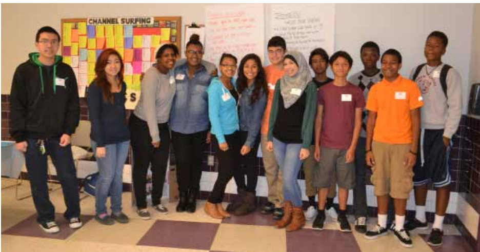
Teens from the Malden High School Interact Club help out for a Malden Reads community event.

We thank you for your interest in Malden Reads and are excited to have you participate as a volunteer in whatever way you are able! Welcome to our team!