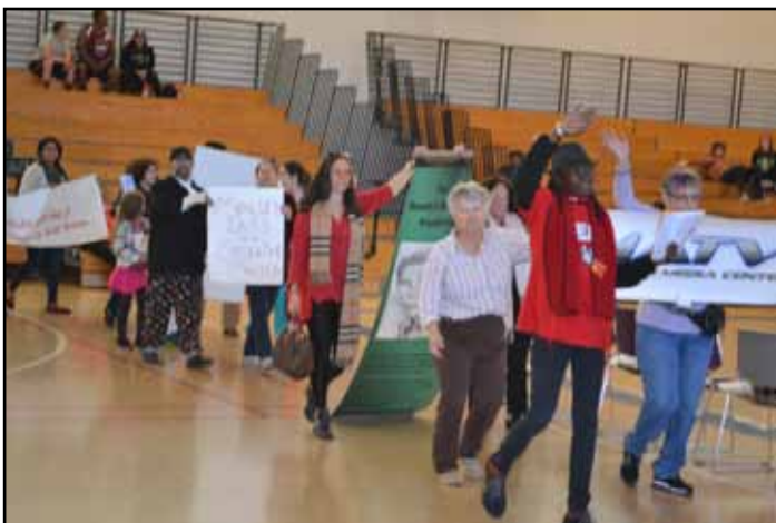
Bringing the community together with a Parade of Community Organizations at the Community Jamboree, a capstone event for the 2013 program ("The Absolutely True Diary of a Part-time Indian" by Sherman Alexie.)