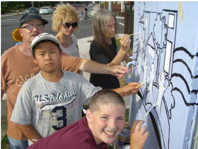
In 2013, volunteers paint the Malden Reads switchbox located on the corner of Broadway and Route 60.

* Companion books for younger readers are chosen for each year of the program. For complete details about each book selection and a listing of the companion book choices, visit maldenreads.org/books .