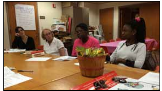
Committee members discuss which book should be selected for 2016.

Love to read? Want to have a say in which book is chosen for the next year's program? Then consider joining the Malden Reads Book Selection Committee. This group has a few meetings during the summer and is asked to read or skim a handful of books on the long list, thoughtfully consider the choices for the community, collaboratively cull down the list and read the final selections in order to take part in the final vote. We also have a separate sub-committee to choose the Companion Books for younger readers once the main book has been selected.