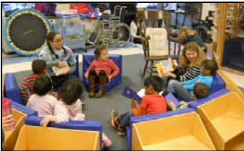
Partnering with "Raising a Reader" at the Early Learning Center.

The previous Film Coordinator for several years has moved away and we are seeking new leadership and a committee of folks to be involved. The film committee brainstorms a list of relevant films and chooses a select few, obtains any legal rights to show the films and secures copies of the films to be screened, coordinates venues and a discussion leader for each film, ensures that media equipment is set-up and tested prior to the film event, organizes (or delegates) refreshments, and does follow-up after the film.