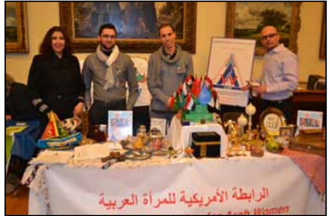
The American Association of Arab Women present a display and interactive booth at the Malden Reads Opening Celebration.

Good at gathering data and statistics? We are looking for someone to more formally collect data and feedback from the community about our program so that we can provide this information to potential donors and also improve our program each year. Let us know if you can help!