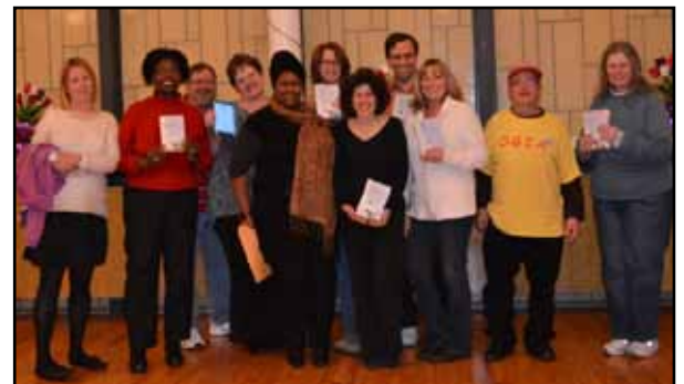
Members of a book discussion group for "Outcasts United" in 2012.

We are looking for one or two co-coordinators or a small team to organize the book discussion series. This involves outreaching several venues, finding book discussion leaders, coordinating dates and times, and coordinating