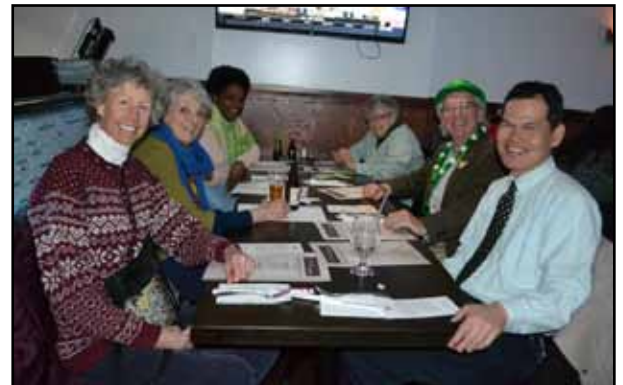
Diners at a community dinner at Oppa's Korean Restaurant in 2015

June Macdonald is the primary point person for the Community Dining series. She can use help outreaching dining venues, helping to publicize the restaurant and food, confirming details as the program kicks off, and being present at any of the dinners to ensure the Community Dining program runs smoothly.