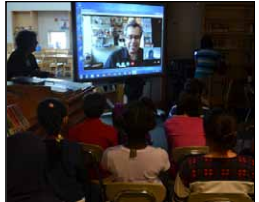
Photos document our history! This one captures students at the Ferryway School engaged in a Skpye chat with author Chris Grabenstein.

Like to scrapbook? Help us put together our annual scrapbook (usually just two meetings each year)—another way to document our program and display it at local events.